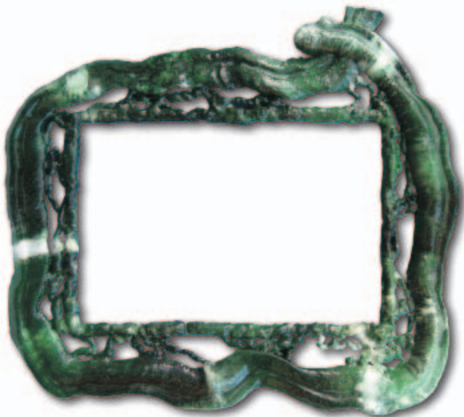
The sculpture Yu Dai Ping 雕塑玉帶屏