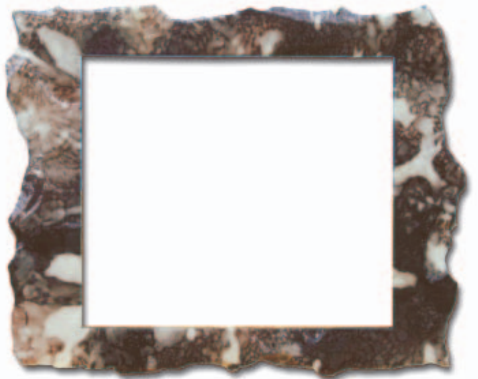
Tallow Jade Made With Ease 羊脂小弄