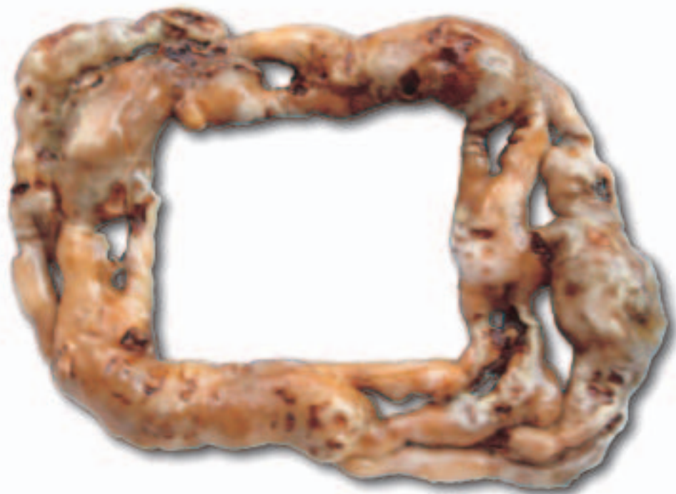
The sculpture Lao Can Gen 雕塑老殘根