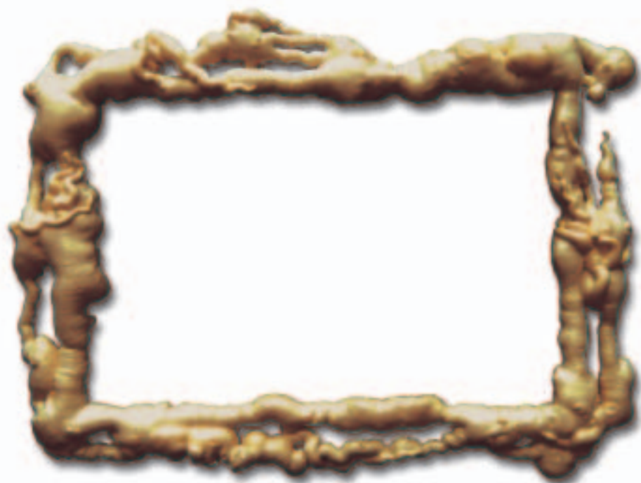
Elegantly Sculpted Tree Roots 雕塑高雅樹根框