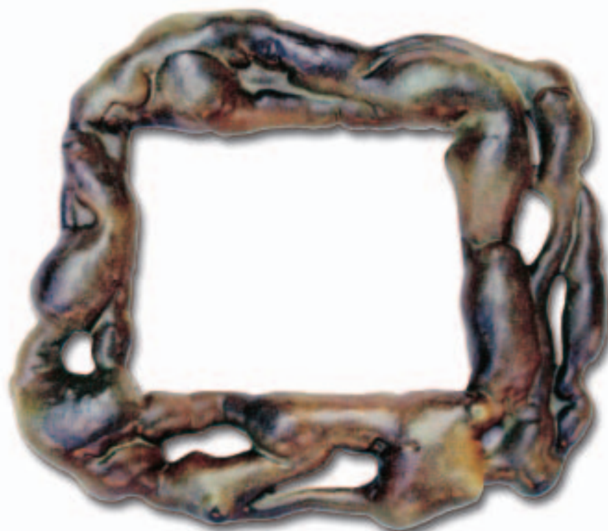
Twining Tree Roots 盤樹框