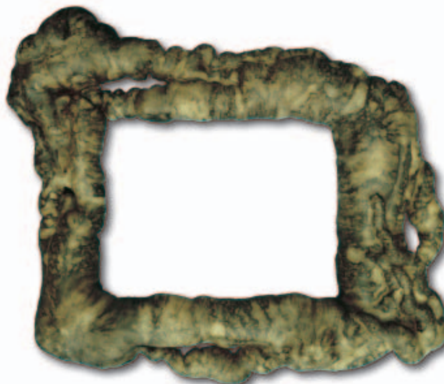
The sculpture Zi Tan 雕塑紫檀