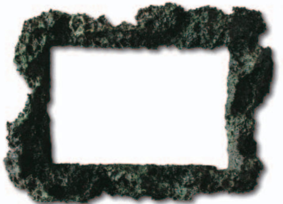
The sculpture Feng Gang Yu 雕塑鋒鋼玉