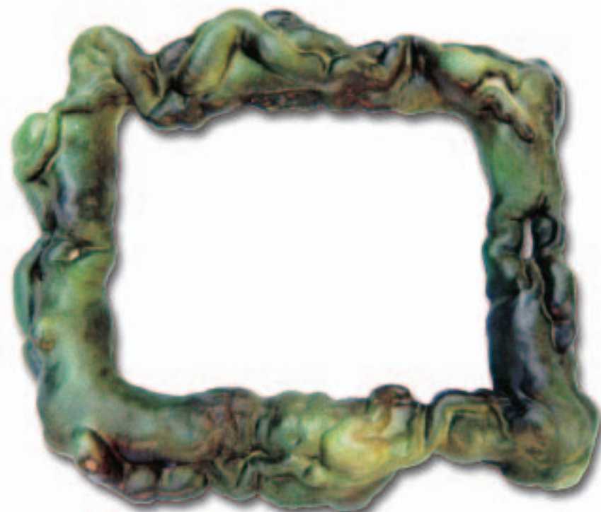
Jadite Green 碧翠