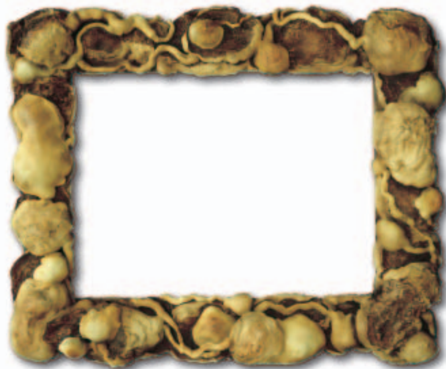
The sculpture Jun Ling Zhi 雕塑菌靈芝