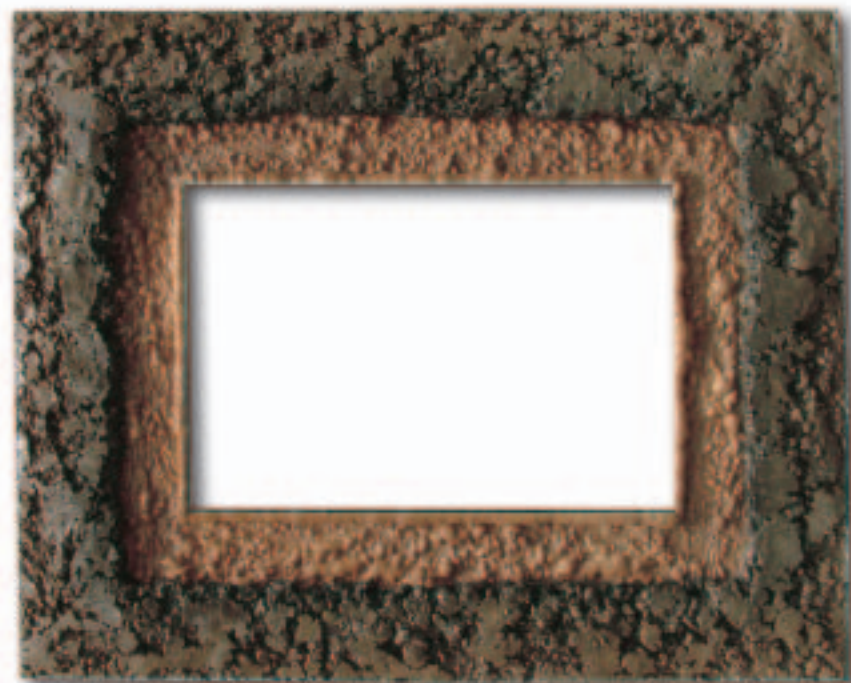
The sculpture Zang Wang Lu Gua 雕塑藏王爐挂