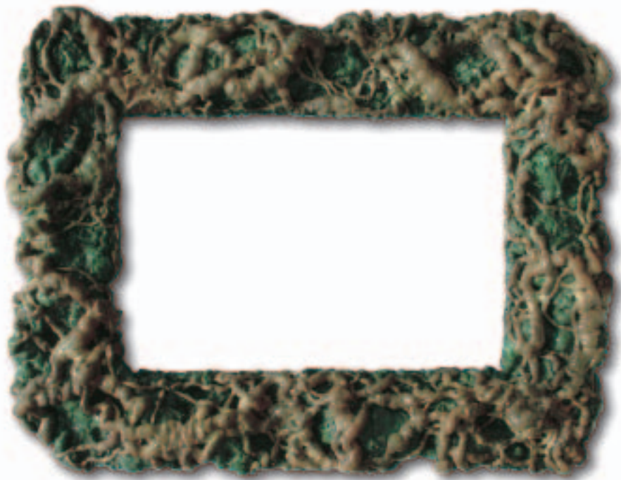
The sculpture Zi Luo Bao Shi 雕塑紫蘿抱石