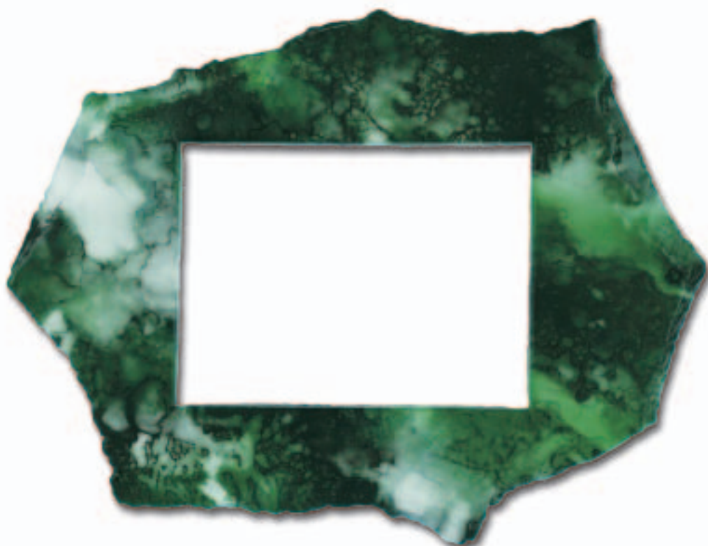
The sculpture Fei Cui Yu 雕塑翡翠玉