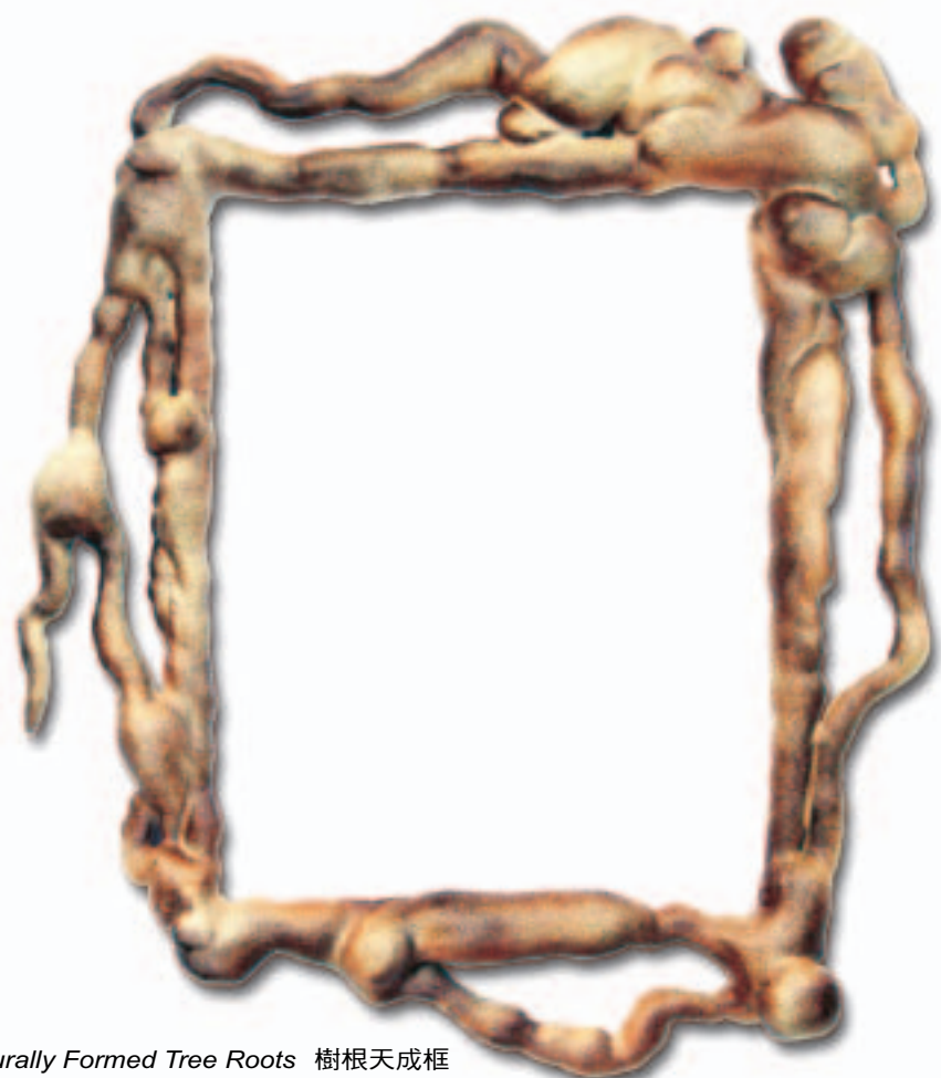
Naturally Formed Tree Roots 樹根天成框