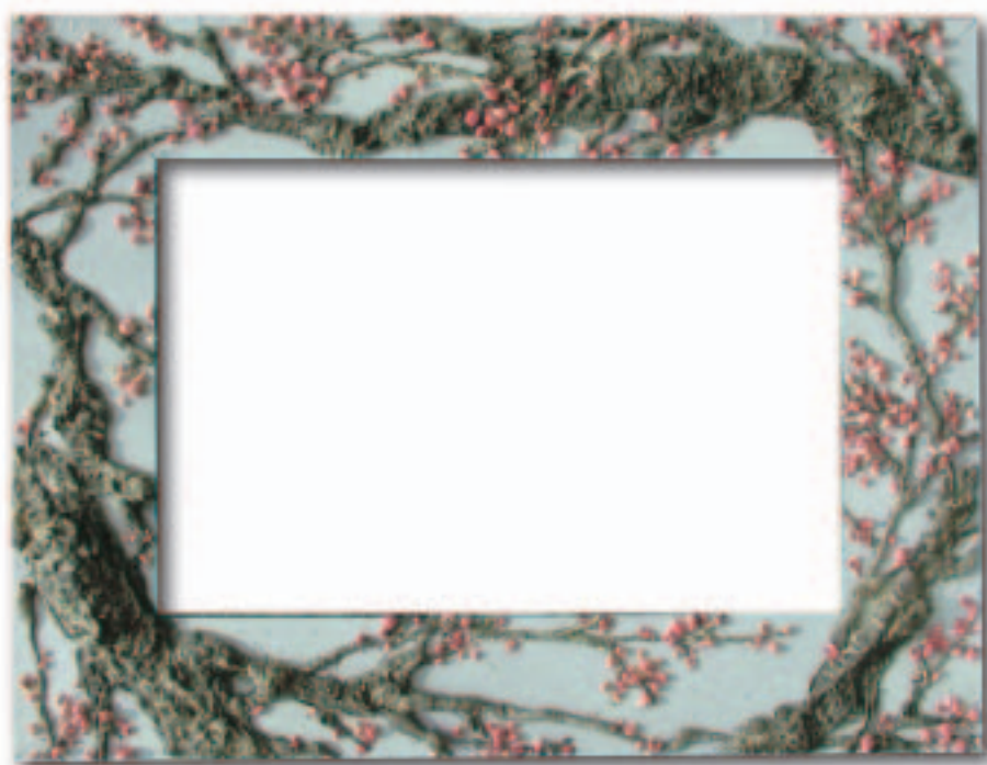
Cold Fragrance 寒香